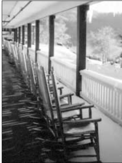
ROCKING CHAIRS ON THE PORCH... AFTER A SNOWSTORM