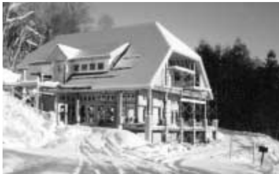
Right: Bishop Johnson Hall after a snowfall in this January