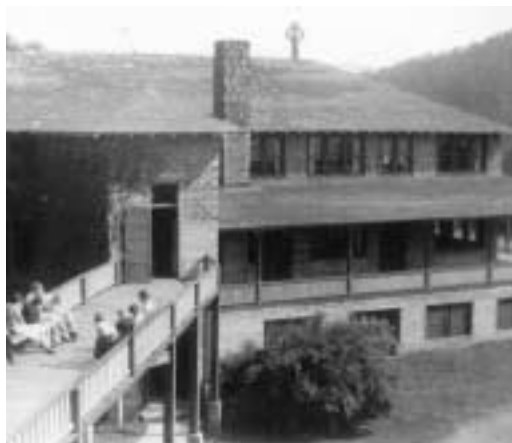
1932 photograph showing the bridge and the electric cross